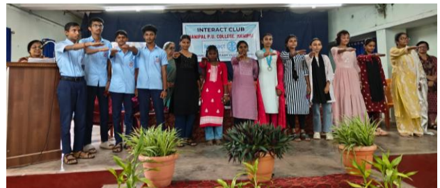
Installation of Interact Club of MPUC, Manipal (High School & College Section on 11 th July 2025