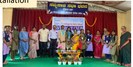
Installation of Interact Club of Govt. Girls High School & Govt PU College for Girls on 8 th July 2025