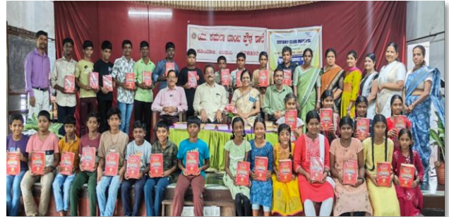
U Kamala Bai High School, Kadiyali on 10 th July 2025