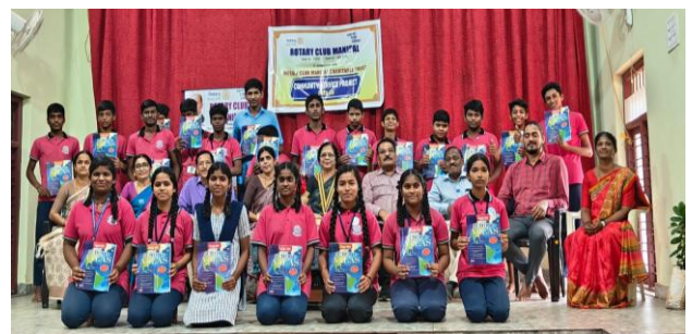
Board High School, Udupi on 12 th July 2025