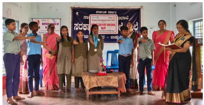
Installation of Interact Club of Board High School, Udupi and Govt. High School, Malpe on 12 th July 2025