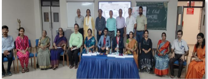
Installation of Rotaract club of Sri Dharmasthala Manjunatha College Udyavara on 9 th July 2025