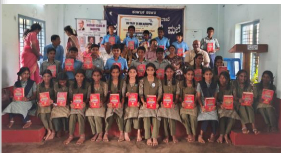
Govt. High School, Malpe on 12 th July 2025