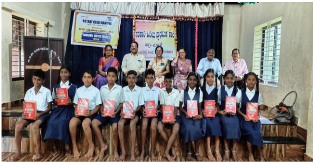
Govt. Higher Primary School, Sagri Nole & Indira Nagar Govt. High School, Kukkikatte on 10 th July 2025