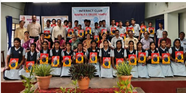
MPUC, Manipal High School on 11 th July 2025